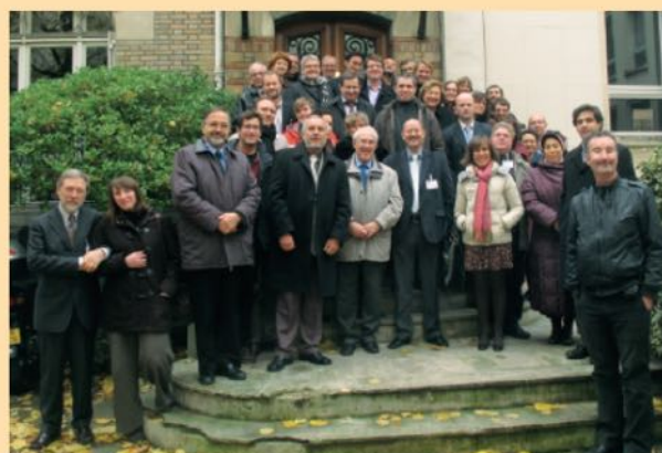
CGS Europe participants at the kick-off meeting in Paris, 29-30 November 2010

CGS Europe partners: CO 2 GeoNet, CzGS (Czech Republic); GBA (Austria); GEOECOMAR (Romania); GEO-INZ (Slovenia); G-IGME (Greece); GSI (Ireland); GTC (Lithuania); GTK (Finland); LEGMC (Latvia); ELGI (Hungary); LNEG (Portugal); METU-PAL (Turkey); PGI-NRI (Poland); RBINS-GSB (Belgium); SGU (Sweden); SGUDS (Slovakia); S-IGME (Spain); SU (Bulgaria); TTUGI (Estonia); UB (Serbia); UNIZG-RGNF (Croatia)